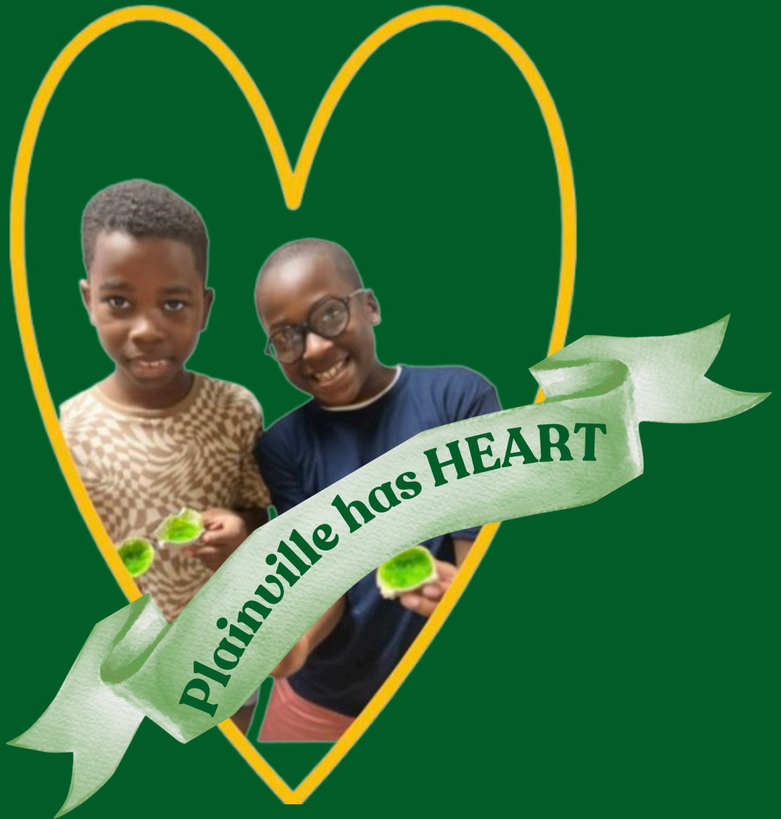
Beatrice H. Wood School