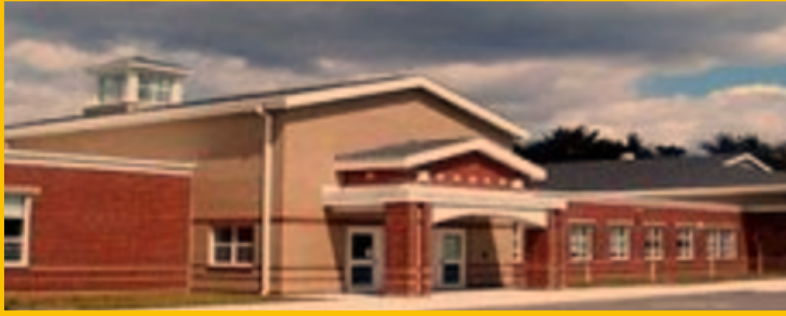
Anna Ware Jackson School